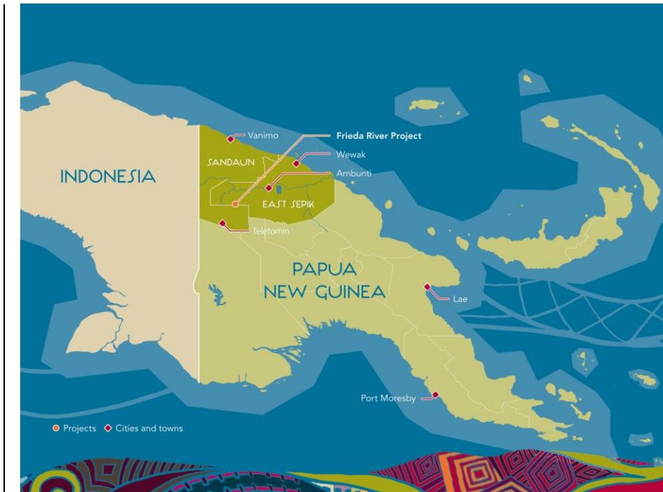
Figure 1: Map showing location of Frieda River Project site

Paupe, all villages are in the Sandaun Province.