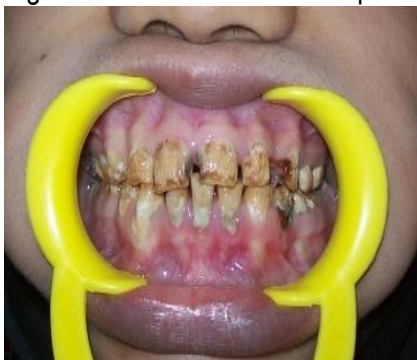
Figure 3: Clinical appearance of teeth