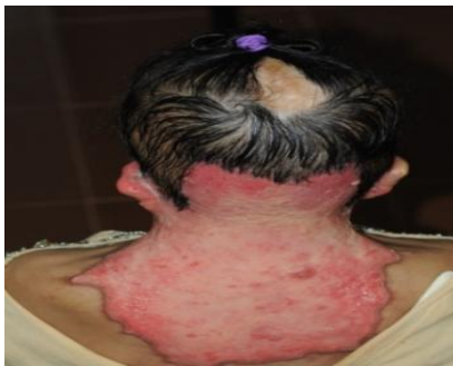
Figure 1: Dermal lesion in occipital region

Panoramic radiograph revealed a normal pulp chamber and root canal spaces. The enamel was completely lost, radiopaque dentin is clearly appreciated. Based on history, clinical and radiographic features the diagnosis of hypoplastic; rough, autosomal recessive AI was made. The patient was referred for dermatological treatment and restorative rehabilitation.