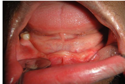
Figure 2: Only lower right second molar tooth present in the mandibular arch in the elder sibling