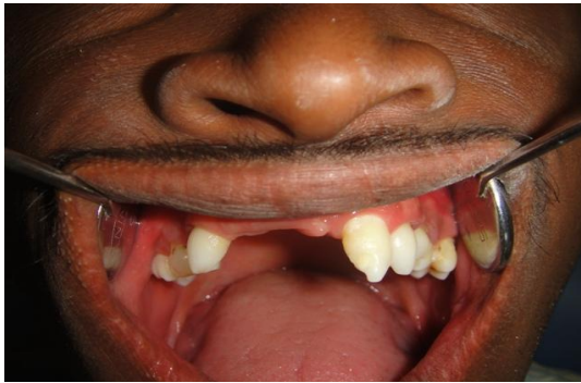
Figure 1: Partial anodontia and conical shaped anterior teeth in the elder brother

complete absence of sweating from birth. Their maternal grandfather had similar complaints. Dental examination revealed partial anodontia and maxillary incisors were conical in shape [Figure-1, Figure-2 and Figure-3]. They both complained of xerostomia. The combined clinical and dental findings pointed towards diagnosis of hypohidrotic ectodermal dysplasia.