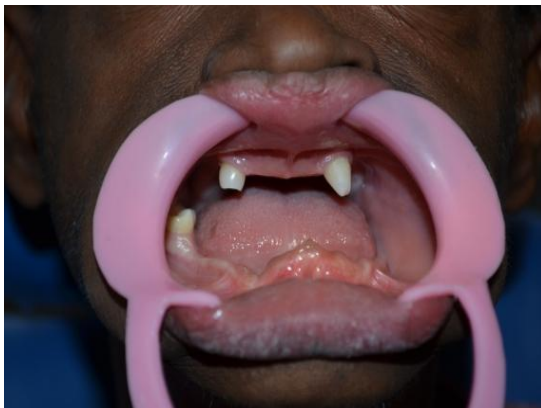
Figure 3: Partial anodontia. Only maxillary canines and right lower mandibular second molar tooth are present in the younger sibling